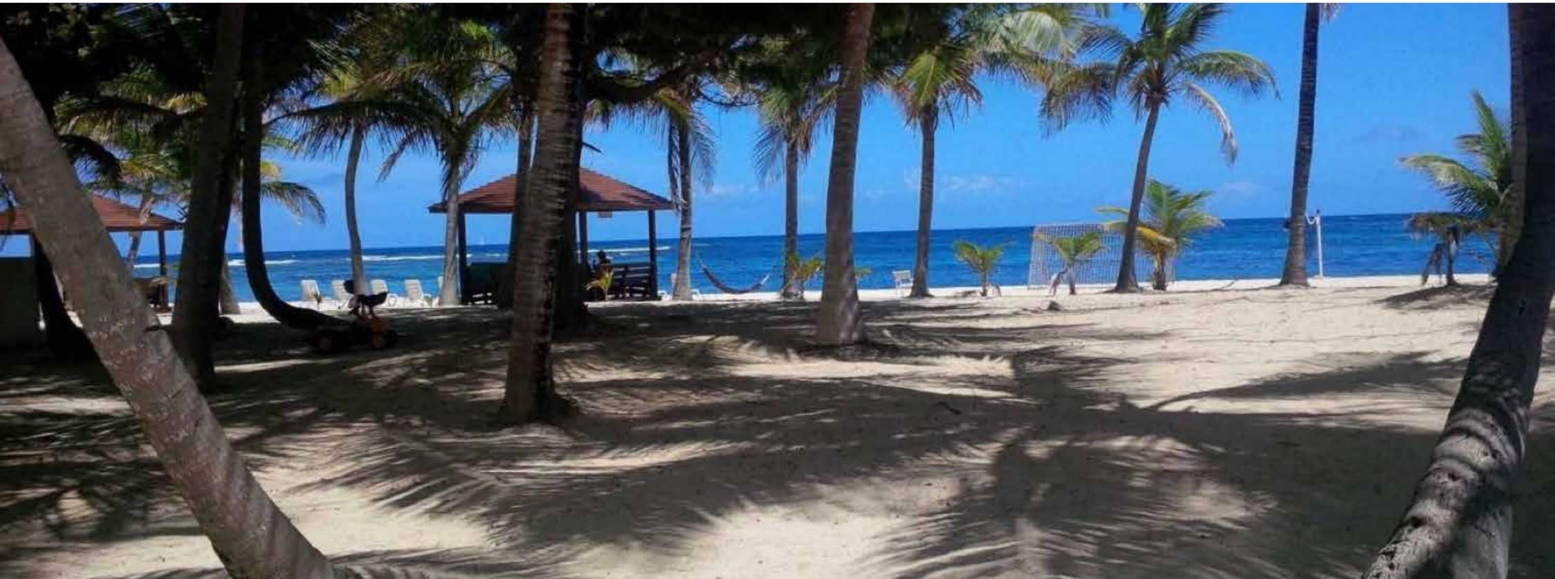
Coralita Beach. One of the last remaining private beaches on St Martin.