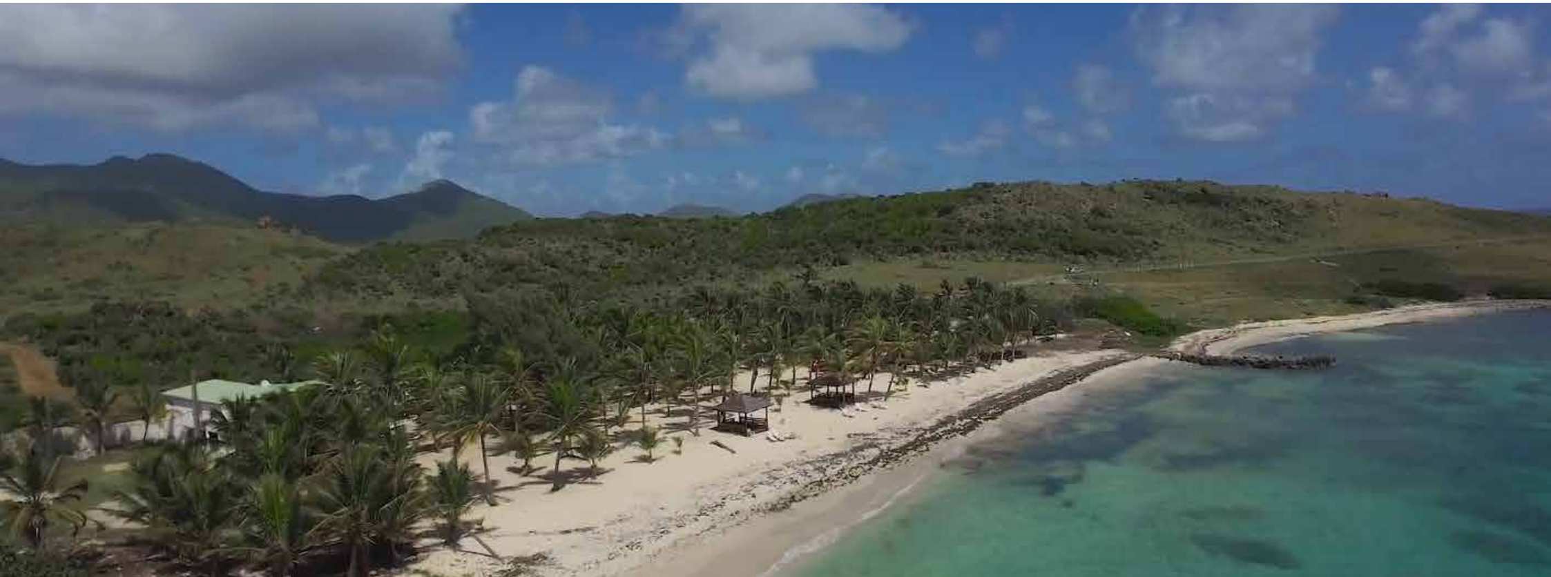
Coralita Beach. A rare opportunity surrounded by beauty & nature.